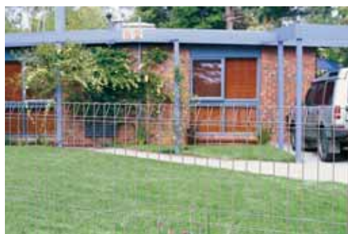
Banksia in Charcoal.