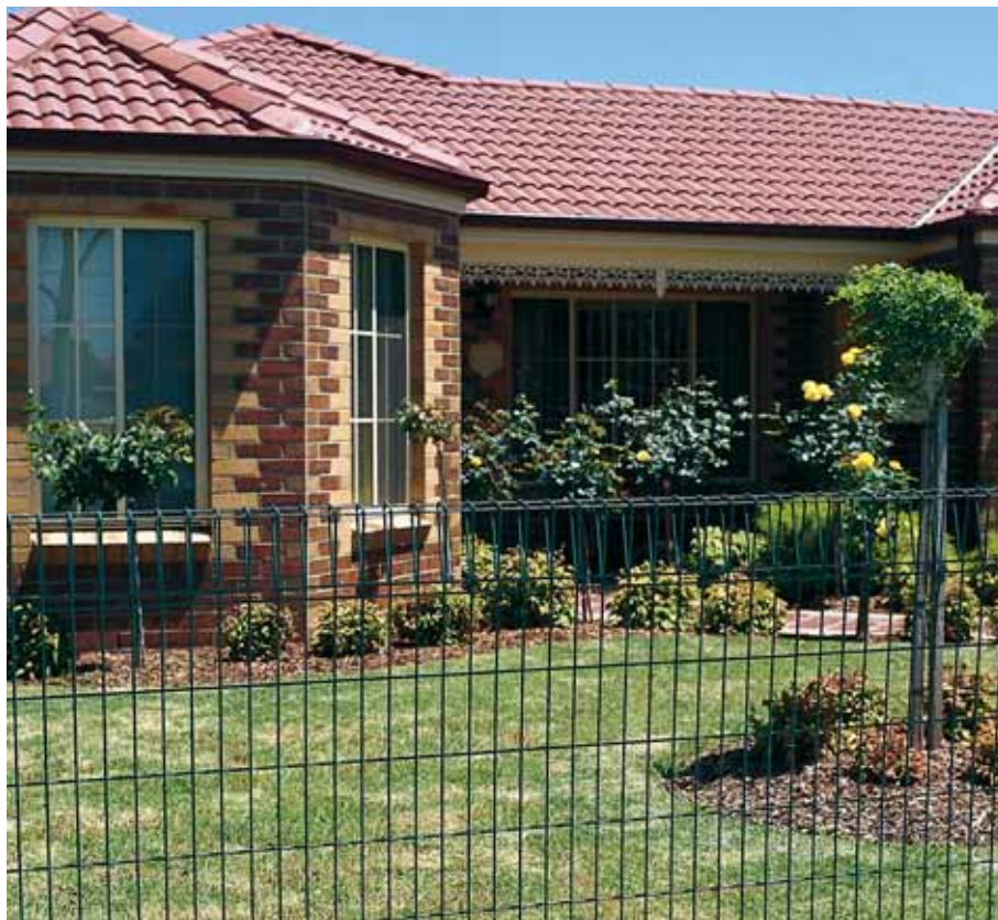
Garden in Claret.