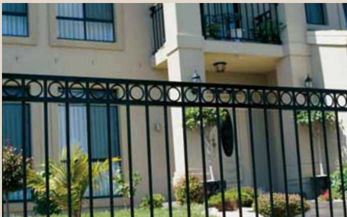
Blaxland in Black.