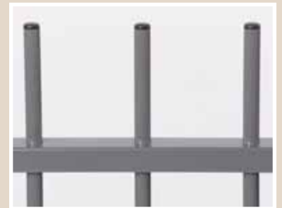
Bass fence through rail design for maximum strength.

Tube size: 16mm or 19mm diameter vertical tube