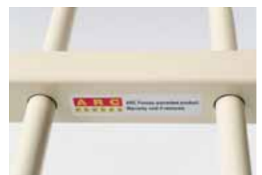
Authentic A.R.C. Fences sticker.

When purchasing an A.R.C. Fence, look for the authentic A.R.C. Fences sticker. The sticker appears on the underside of the top rail on tubular A.R.C. Fences and on the underside of the bottom rail for wire-based A.R.C. Fences with top and bottom rails.