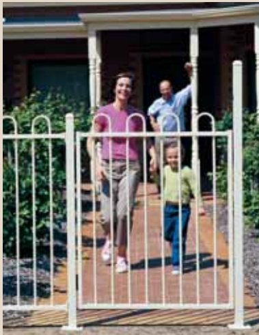
Lassiter in Cream.

I love the long Summer nights. Is there anything better than a cool drink on a warm night?