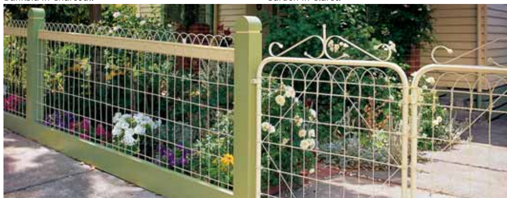
Federation Wire in Smooth Cream 950mm.