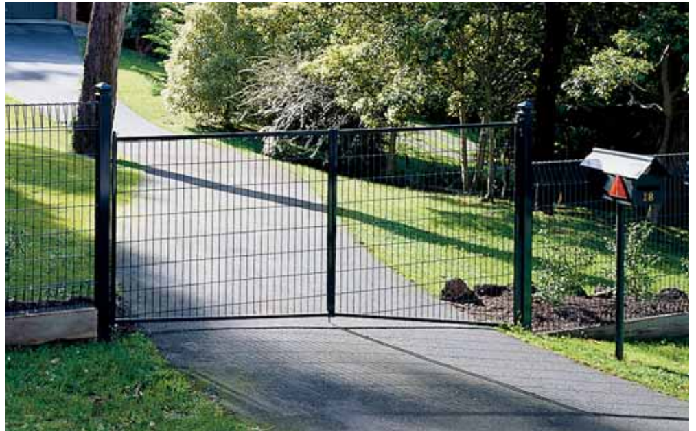
Garden in Black.