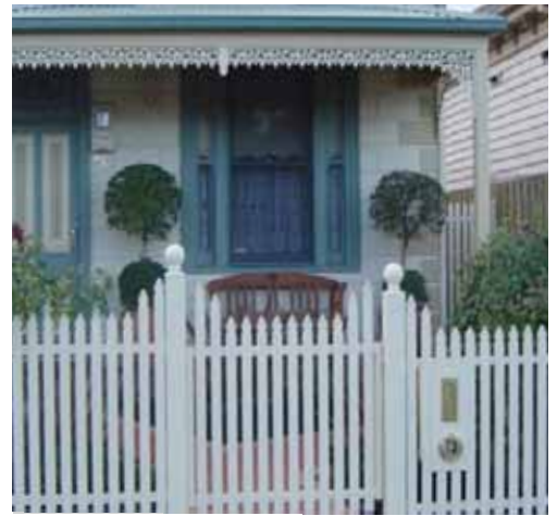
Flinders in Smooth Cream.