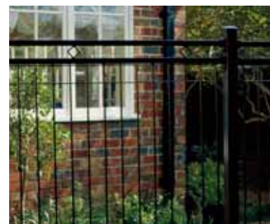
Mayfair in Black.