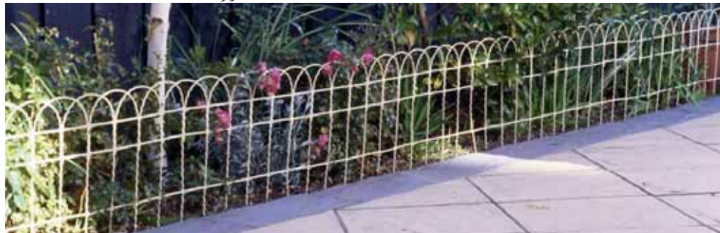
Federation Wire in Smooth Cream 400mm.