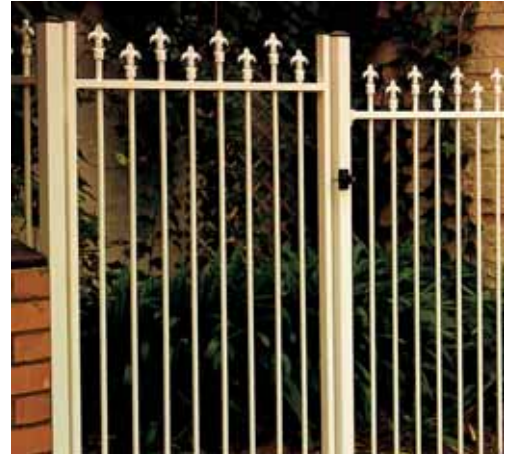
Bourke in Cream.