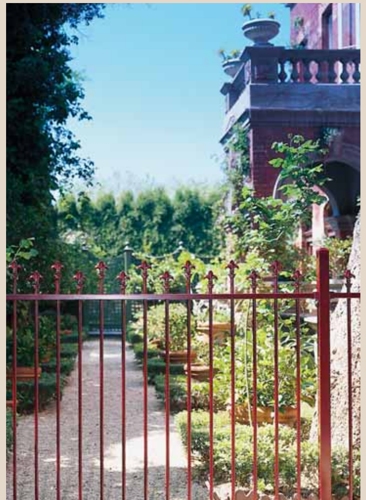
Bourke in Manna Red.

*Options may vary from state to state. Please check with your local A.R.C. Fences representative on 13 15 57.