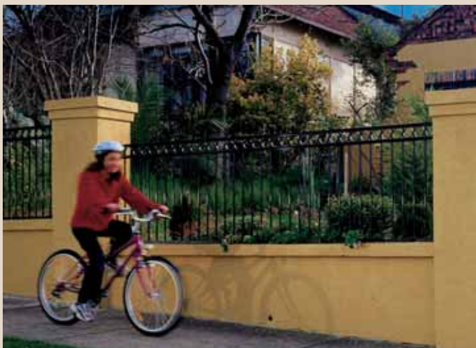
Blaxland in Black, set between elegant brick piers.