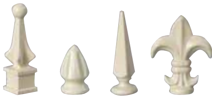
Extensive range of accessories available.

A.R.C. Fences can cater to all your fencing needs with gates and accessories to complete your new fence. Standard and made-to-order gates are available as well as posts and accessories such as post caps, spears for tubular fencing and latches.