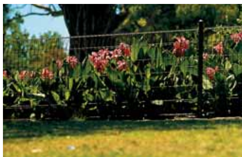
Jacaranda in Black.