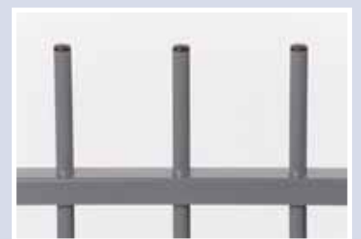
Bass Fence through-rail design for maximum strength.

What’s more, there is no front or back of the fence, so you’ll be able to enjoy the fence from both sides. Tubular designs are available in a wide variety of finishes including galvanised, aluminium or powder-coated*.