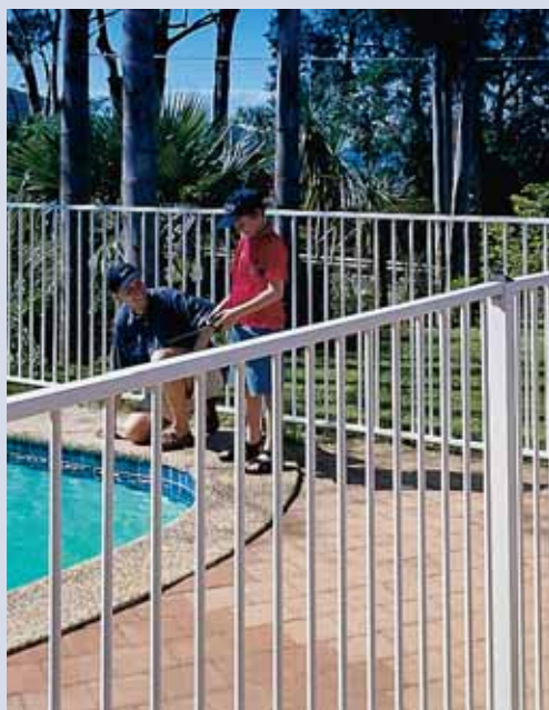
Sturt in White.