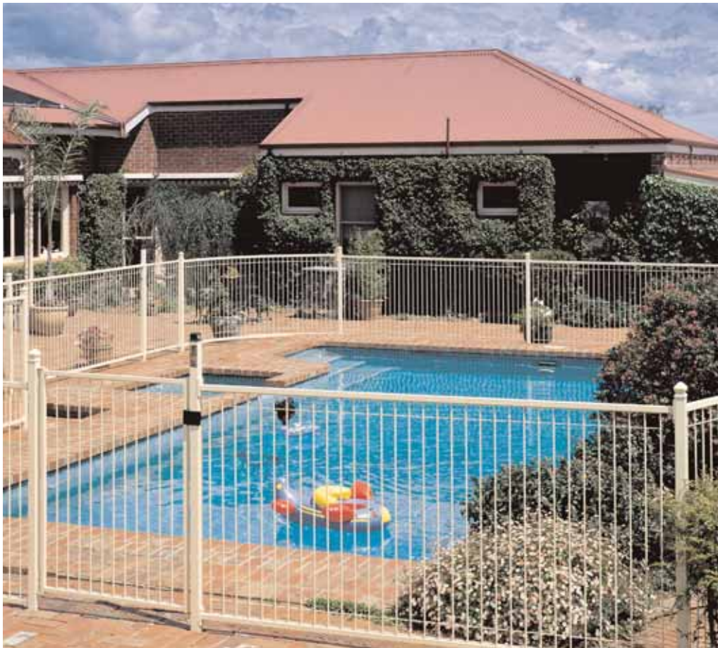
Willow in Cream.