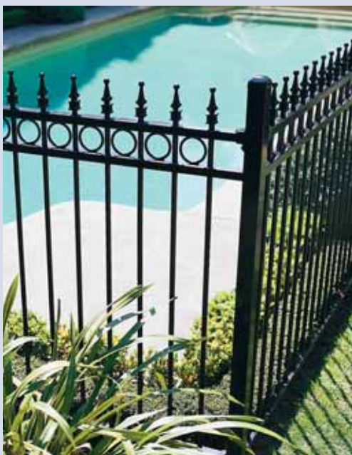
Lawson in Black.