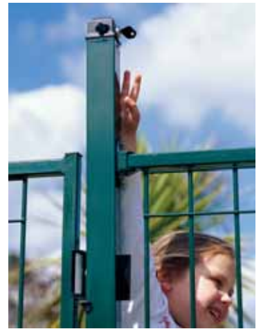
Guardian Safety Latch.

The Magna Latch® is fitted to the outside of the gate and the locking mechanism is designed around the use of 'permanent magnets'. It includes a 'Top Pull' release feature and is key lockable for added safety.