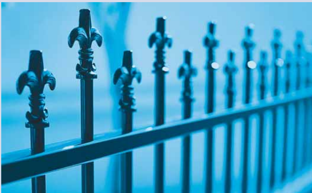
Bourke in Blue.