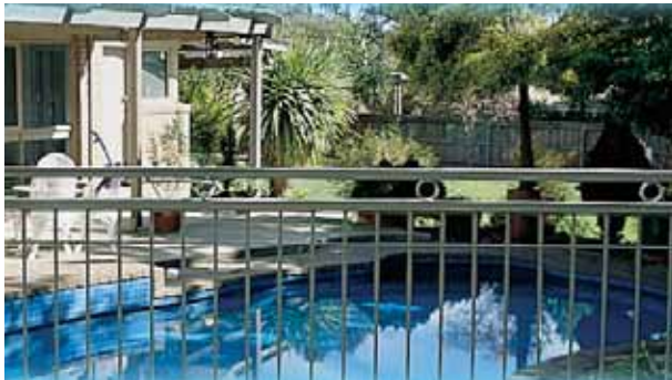
Wentworth in Green.