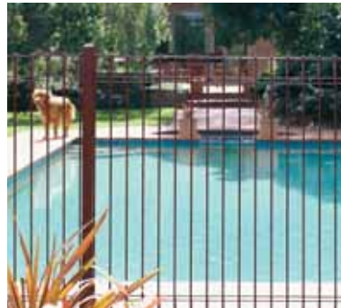
Wattle in Manna Red.