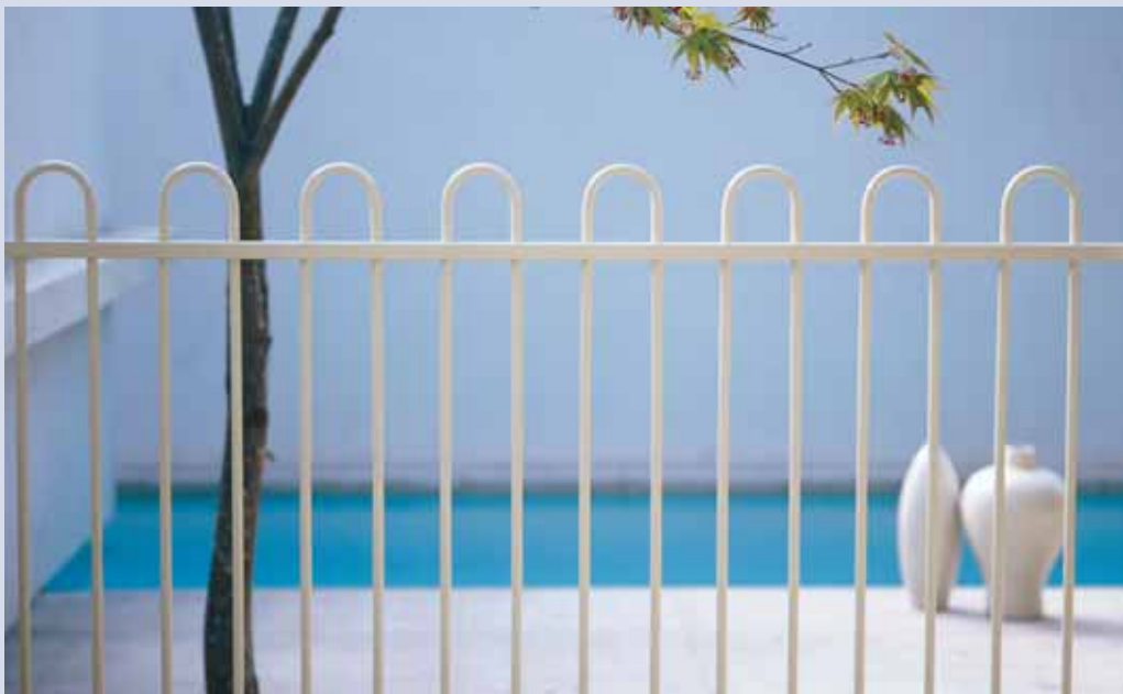
Lassiter in Cream.