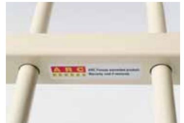
Authentic A.R.C. Fences sticker.