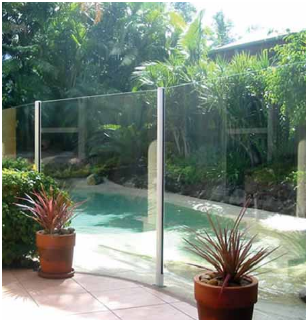
Reef Glass Panels.