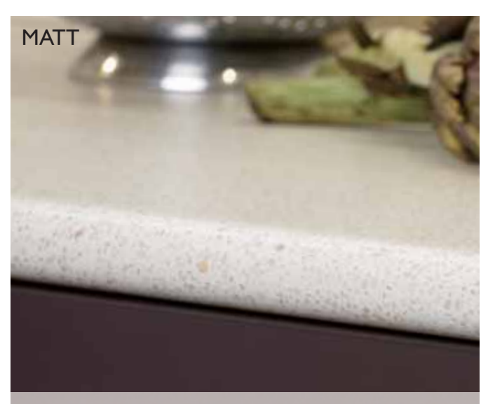
Our Matt finish has a fine textured surface that offers good durability while retaining a high degree of decorative clarity.