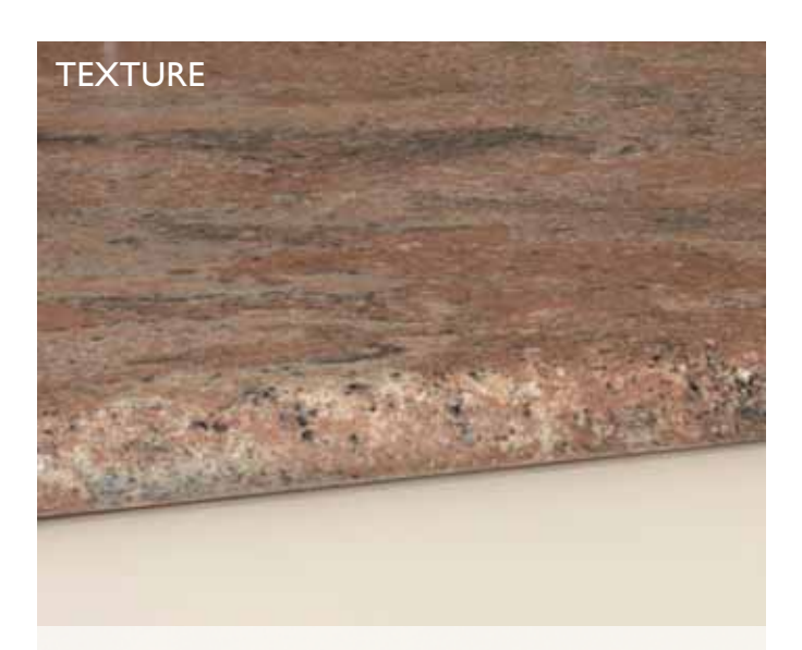
Polytec's LAMINATE texture finish is a traditional, medium textured laminate surface with high durability. The textured finish is not only beautiful in it's own right it is a surface that is perfect for today's lifestyle.