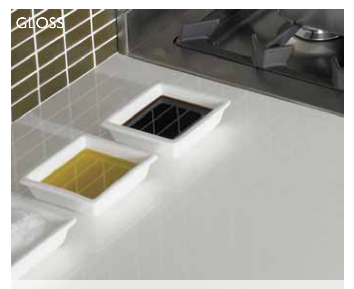
For a finish that provides a luxurious full gloss surface reminiscent of highly polished stones and granites choose our Gloss finish.