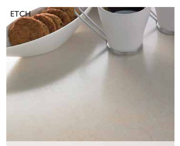
An Etch surface finish provides a pristine polished stone look to your bench top while retaining good surface performance and durability. This will create elegance and the illusion of depth in your kitchen.