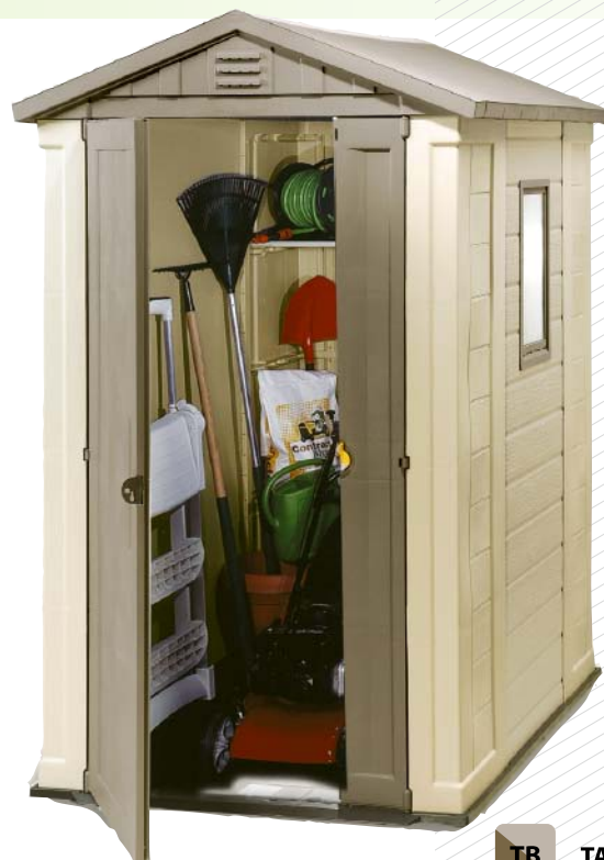
TB TAUPE - BEIGE