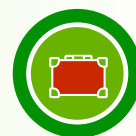
Compact packaging - easy