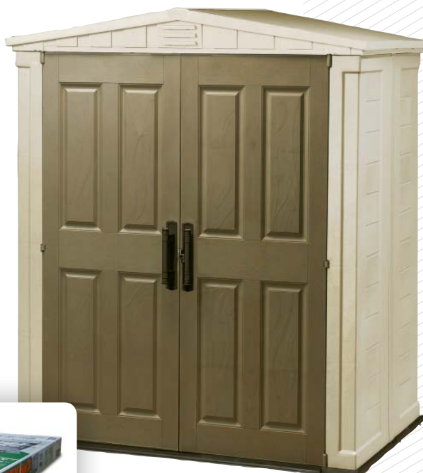
TB TAUPE - BEIGE