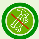
No maintenance required