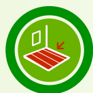
Easy access, floor panel included